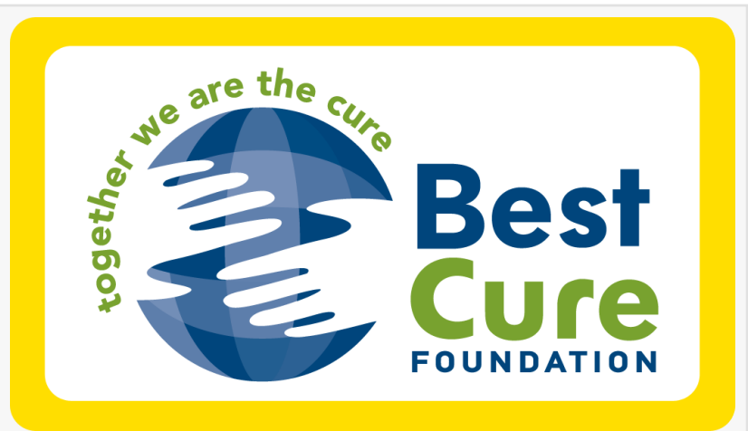
Best Cure Foundation — www.bestcure.md

We want to wish you the very best in accomplishing this Common Prosperity for all Chinese citizens.